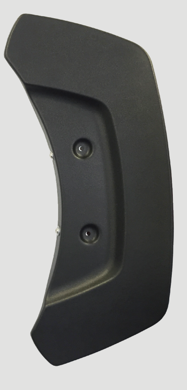
REAR FAIRING PANEL (x2)