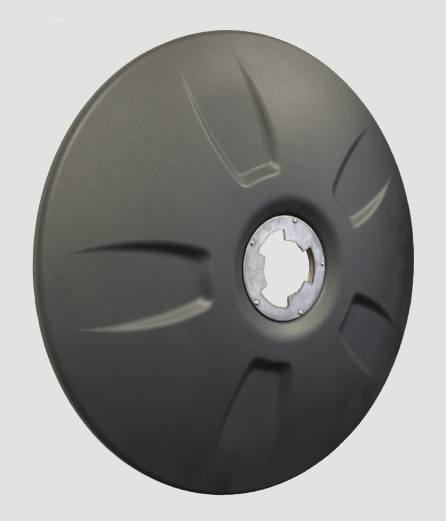
WHEEL COVERS (x4)